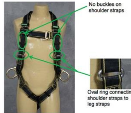
Figure 2 - Affected MSA Gravity Welder Harness

An affected MSA Gravity Harness will have no buckle on the shoulder straps and an oval ring where the shoulder straps connect to the leg straps.